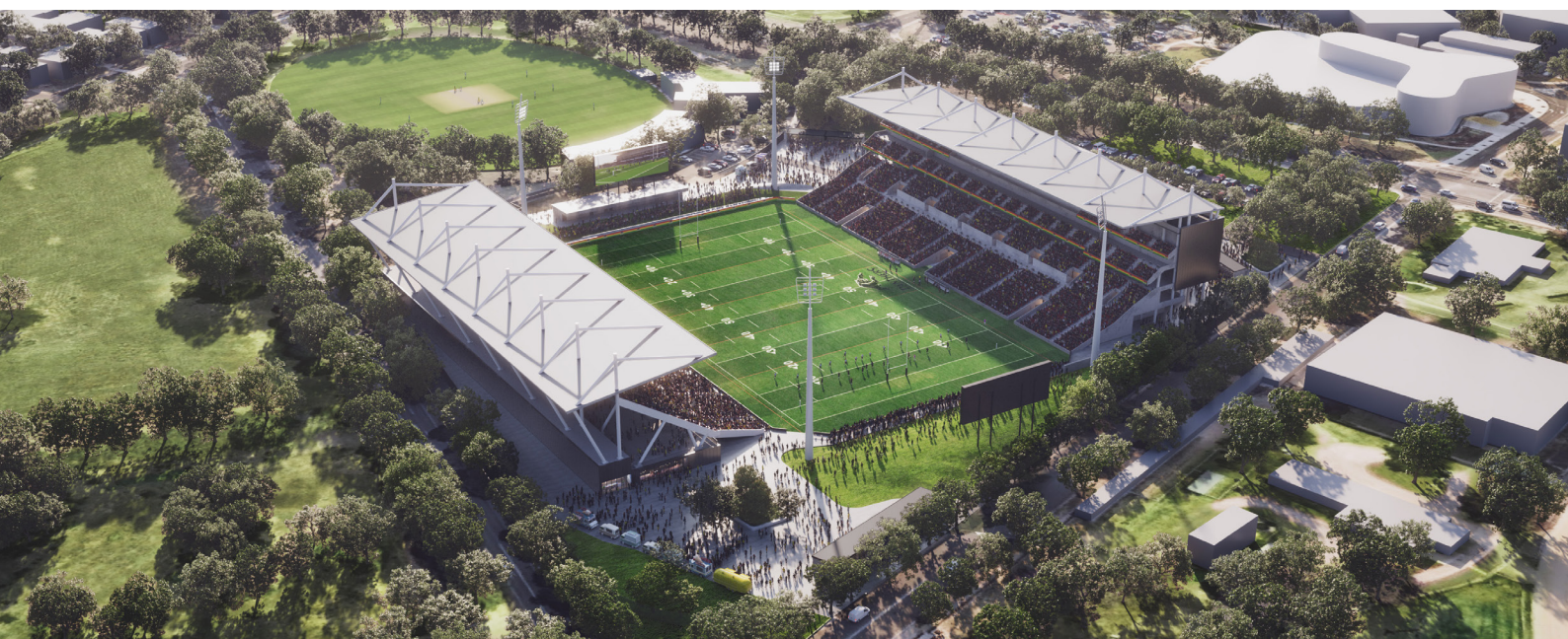
IMAGE: Artist impression of the refurbished Penrith Stadium

A project team of architects, engineers and cost planning experts has been working closely with key stakeholders such as Penrith Panthers and Penrith City Council to design a stadium that aligns with community feedback and delivers value for money.